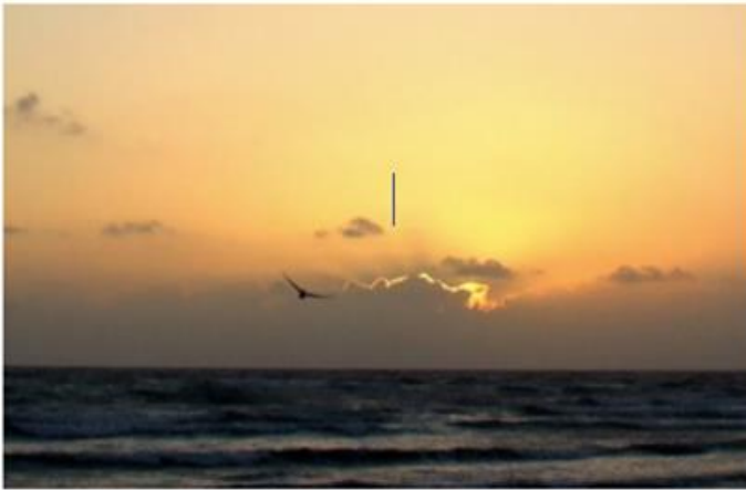
The dawning of another Easter morning reminds us that the Victory is won!